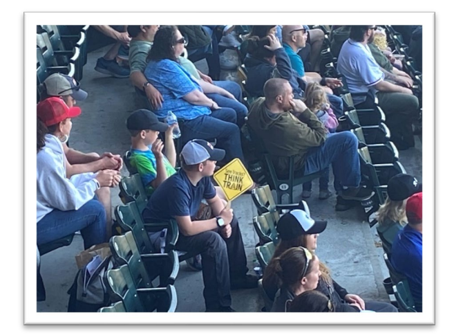
A fan with a fan

The educational portion of the event was funded by WSDOT and the hospitality suite was funded by WAOL as a volunteer appreciation event.