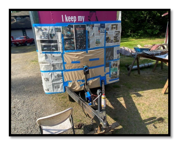
Trailer ready for abrasive-blasting

In contrast, the front of the trailer was beginning to look a little shabby with surface rust appearing in places, even though the trailer has been stored under cover for most of its life.