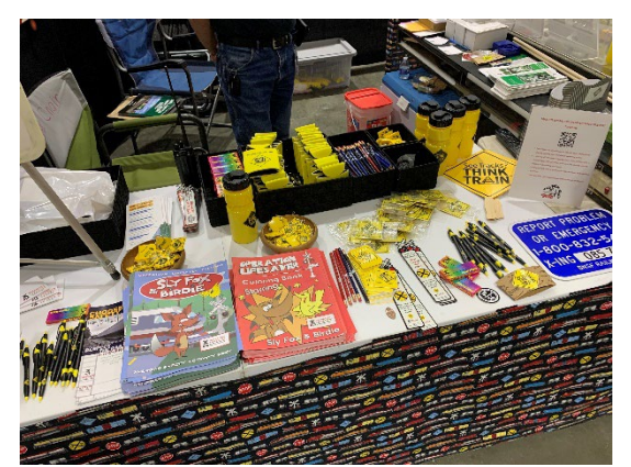
A well-stocked exhibit.