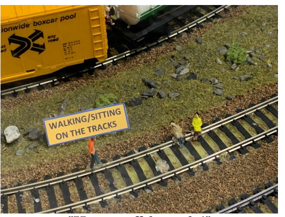
"Hey, get off the tracks!"