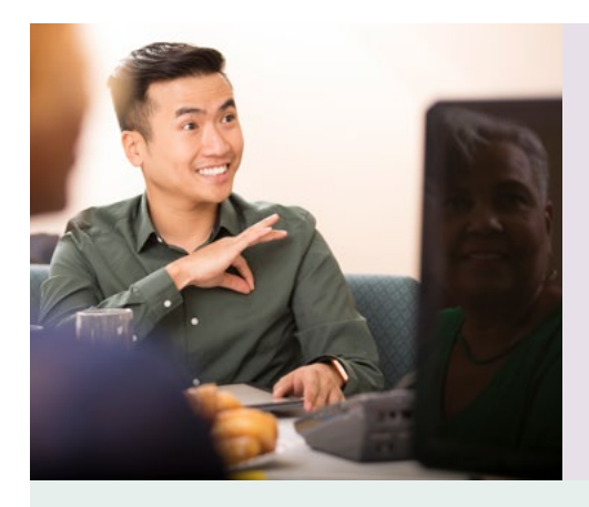
Leadership, Operations & Services: Advance PEAR practices and systems at all levels of state government through transparent and accountable organizational development and adaptive change agent leadership.

Plans, Policies & Budgets: Incorporate PEAR values into plans, policies, and budgets to meet the needs of employees and the communities we serve, eliminating disparities where the needs are greatest.