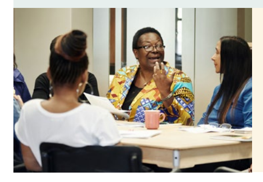
Engagement & Community Partnerships: Build partnerships with communities and employees that inform and support Washington state's PEAR ecosystem.