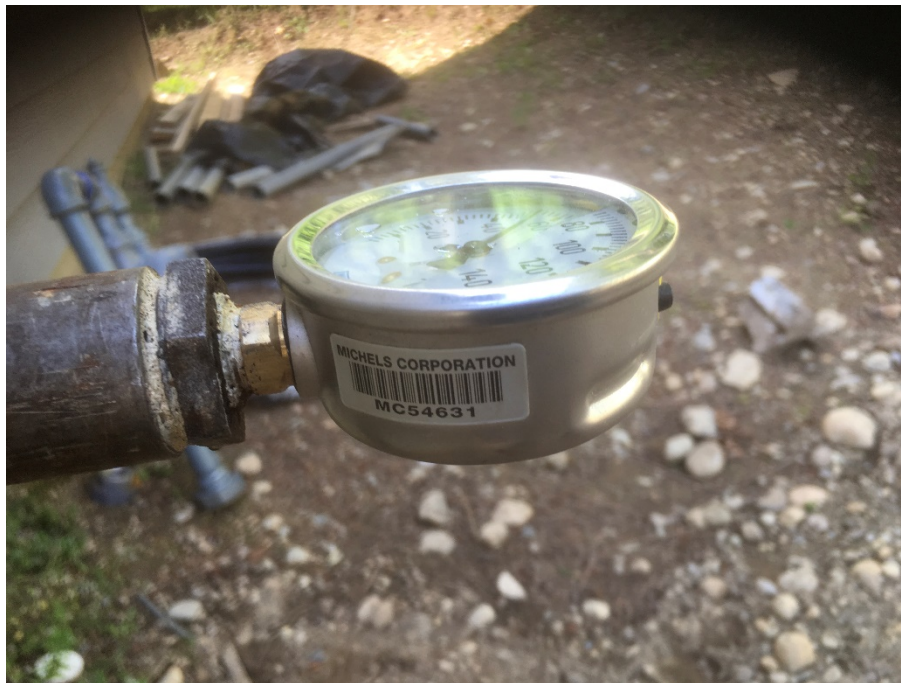
Picture #3 - Verification of calibrated gauge used for new gas service.