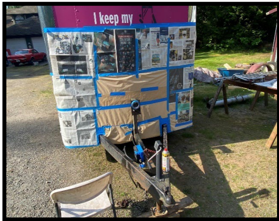
Trailer ready for abrasive-blasting

In contrast, the front of the trailer was beginning to look a little shabby with surface rust appearing in places, even though the trailer has been stored under cover for most of its life.