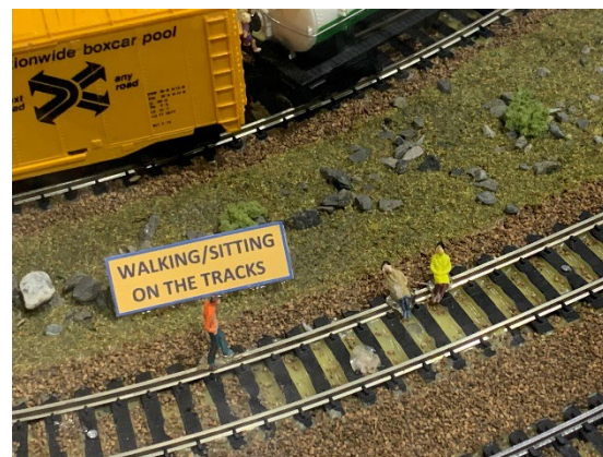
"Hey, get off the tracks!"