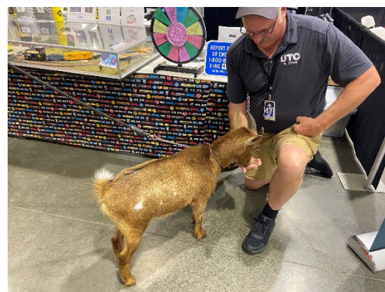
We had a lot of friendly visitors to our booth, including this guy.

I was definitely worn out at the end of the fair, but it was a lot of fun to work with the great folks in the Spokane area to do the important work that we do!